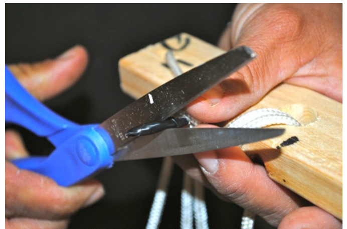
Cut off the taped piece of rope.