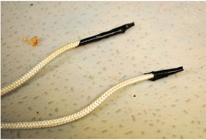
Wrap tape around the 2 rope ends.