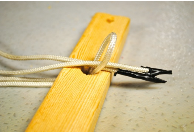
Push the 2 rope ends through the center loop.