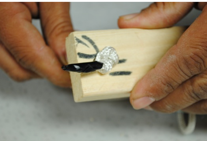
Push 1 loose rope end into a side hole and knot the rope so it cannot slip out.