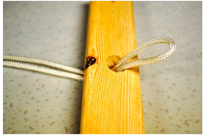
Fold the rope in half and push the center through the middle hole.